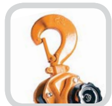
Tip load hook